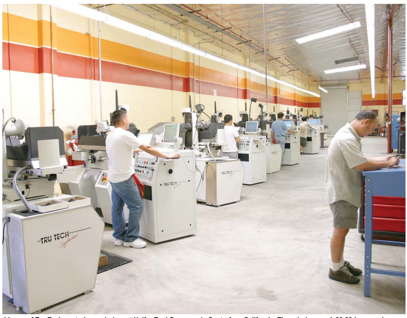
Lineup of Tru Tech centerless grinders at Helfer Tool Company in Santa Ana, California. The grinders work 20-22 hours a day producing precision custom tools for Helfer customers.